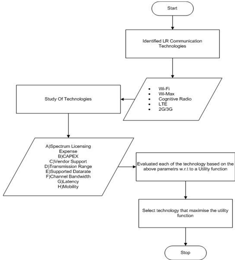
Figure 2: Study and Evaluation of Backhaul Technologies

technologies. Fig. 2 shows the flow chart of the study and evaluation of identified technologies w.r.t the identified parameters.